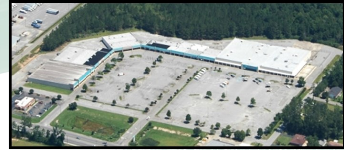
Bay Village Shopping Center 2300 Church Street