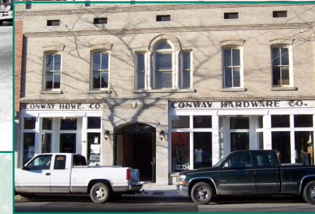
The Old Conway Hardware at 315 Main Street, 2006 recipient of the special tax incentive.